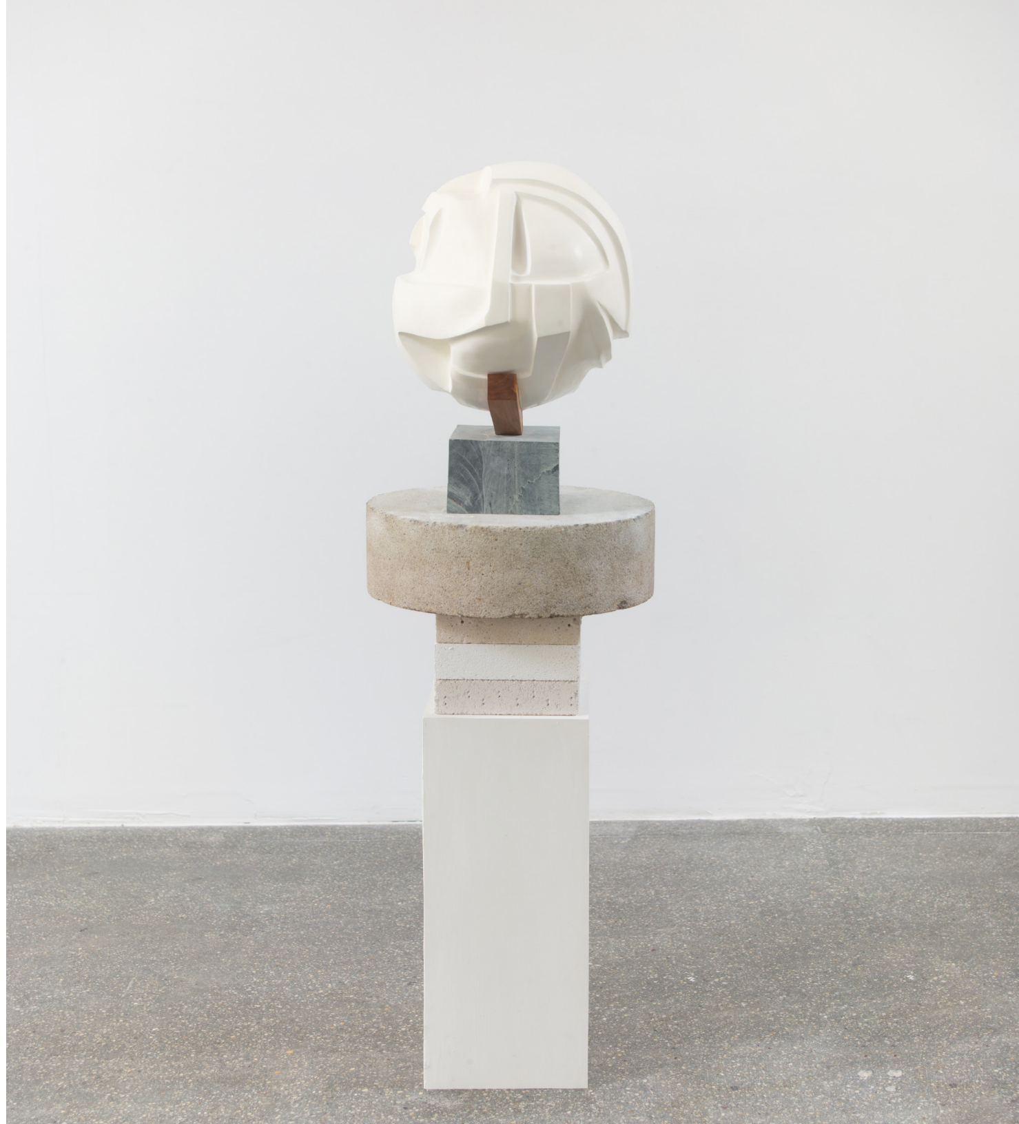
Christina Kruse Will o the wisp , 2021 [detail] plaster, wax, wood, metal, concrete, soapstone, Ytong building blocks 52 x 18 x 20 in 132.1 x 45.7 x 50.8 cm Edition 1/2