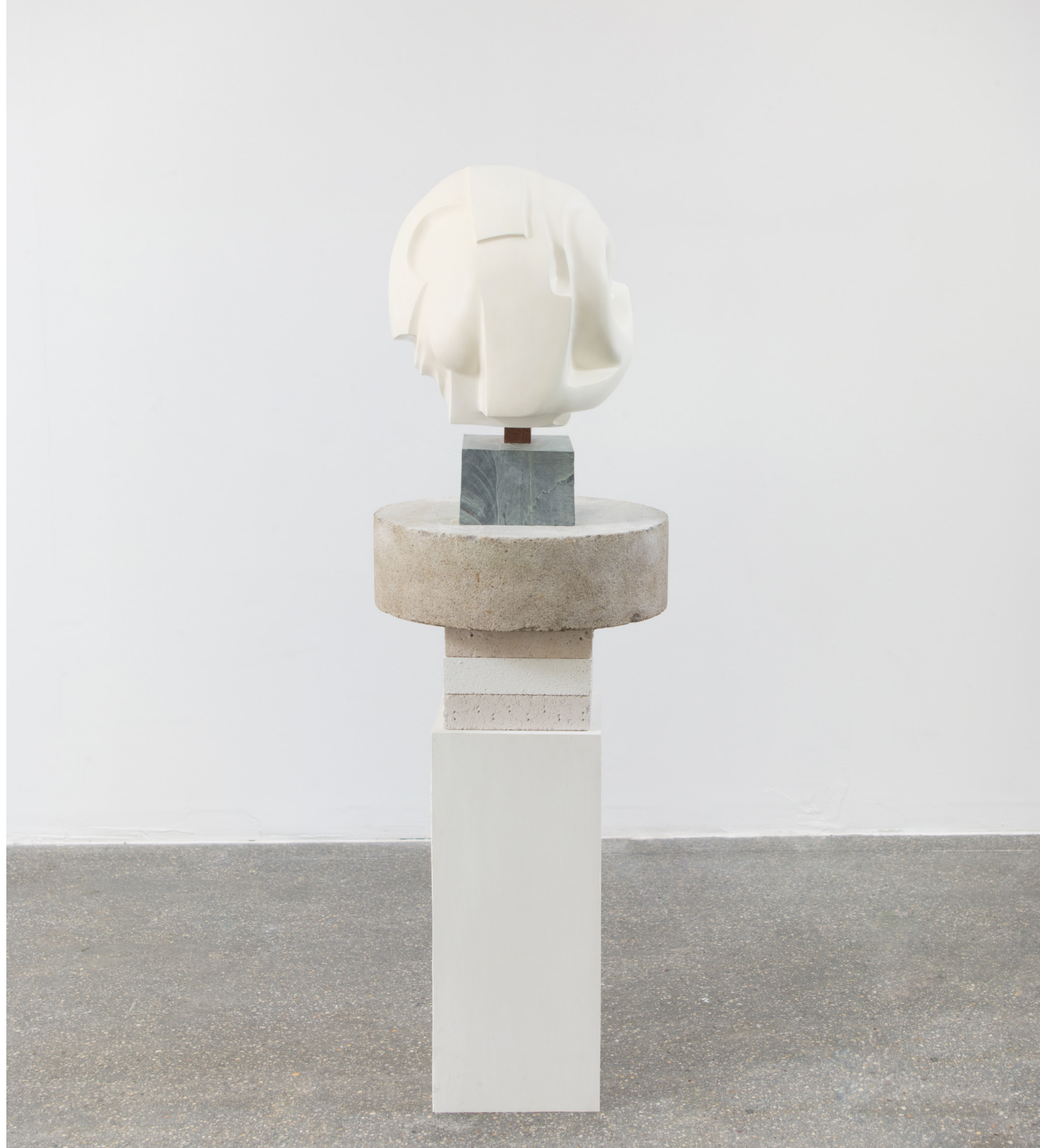
Christina Kruse Will o the wisp , 2021 [detail] plaster, wax, wood, metal, concrete, soapstone, Ytong building blocks 52 x 18 x 20 in 132.1 x 45.7 x 50.8 cm Edition 1/2