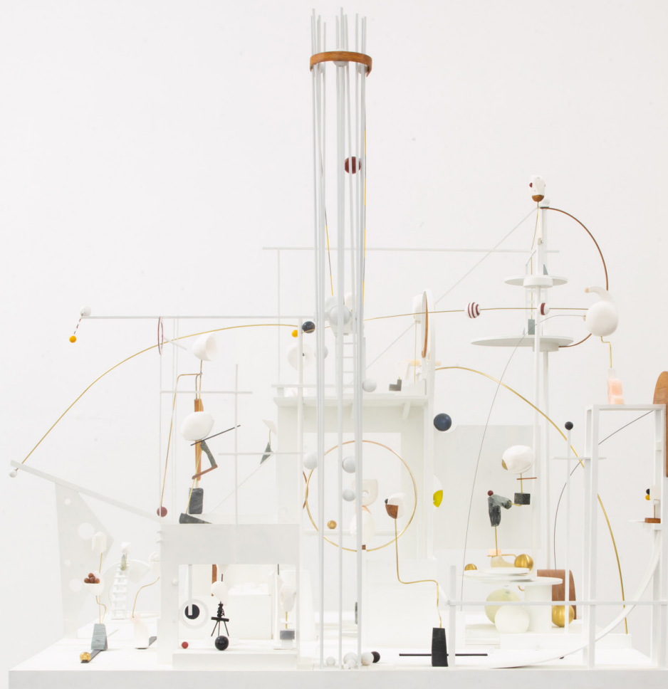
Christina Kruse Lunapark , 2021 plaster, wood, brass, metal, glass, soapstone, alabaster, paint 76 x 42 x 43 in 193 x 106.7 x 109.2 cm $25,000