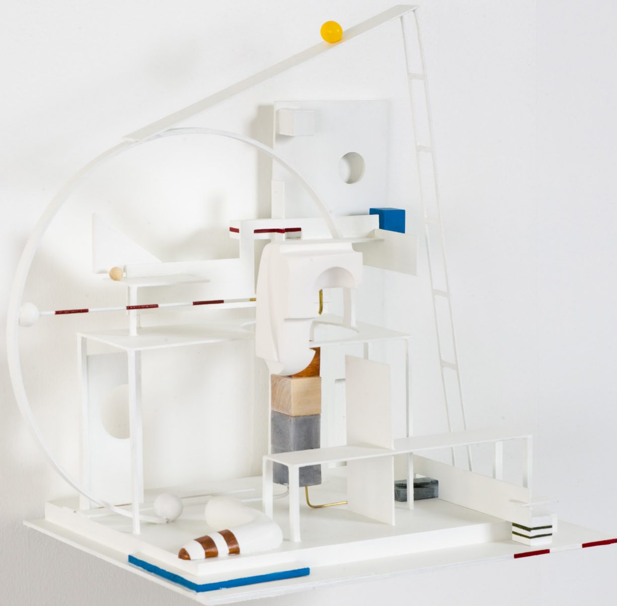
Christina Kruse Intermission , 2021 metal, wood, plaster, soapstone 9 x 13 x 15 in 22.9 x 33 x 38.1 cm Sold; contact gallery for information about commissioned work