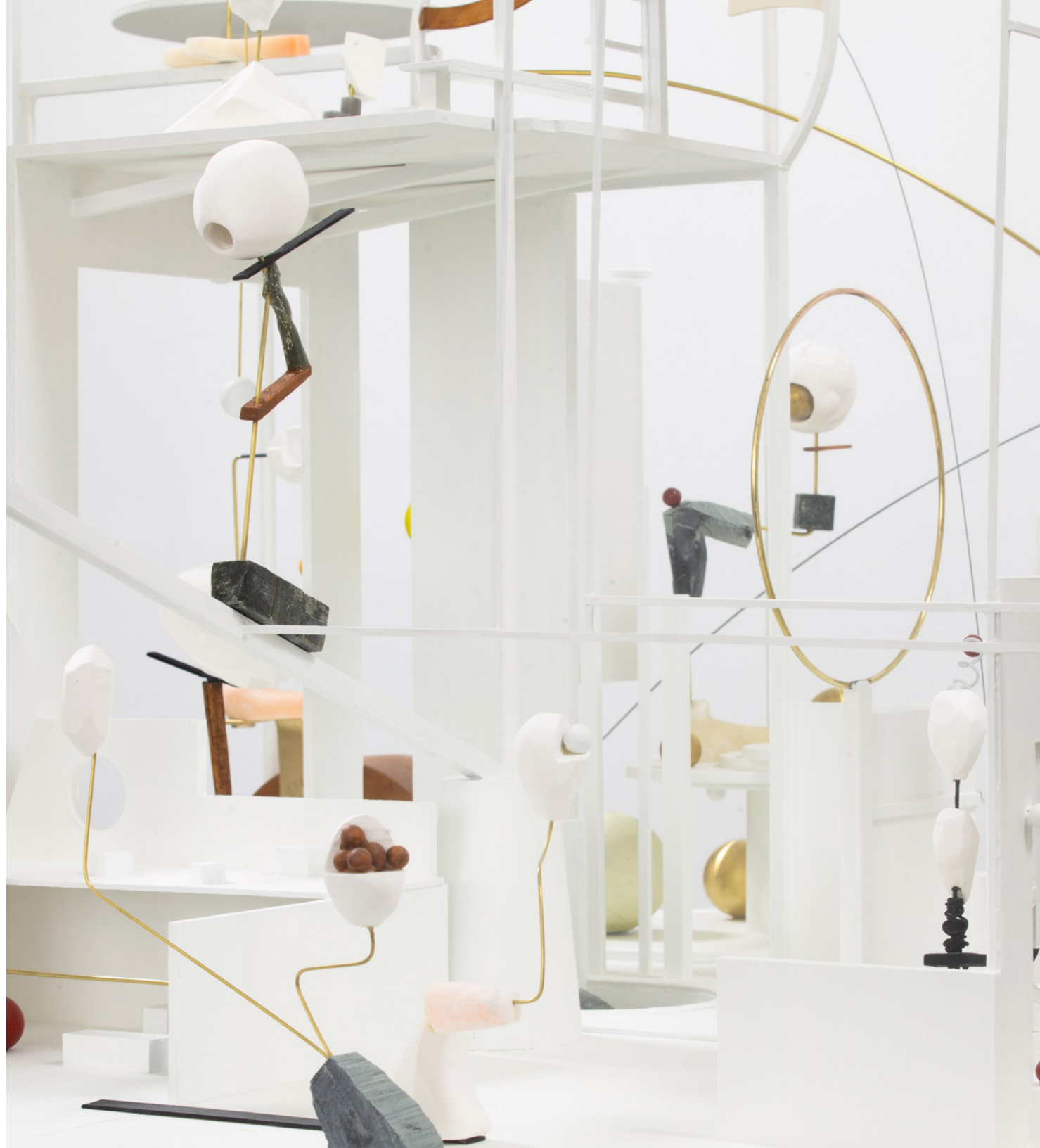
Christina Kruse Lunapark , 2021 [detail] plaster, wood, brass, metal, glass, soapstone, alabaster, paint 76 x 42 x 43 in 193 x 106.7 x 109.2 cm $25,000