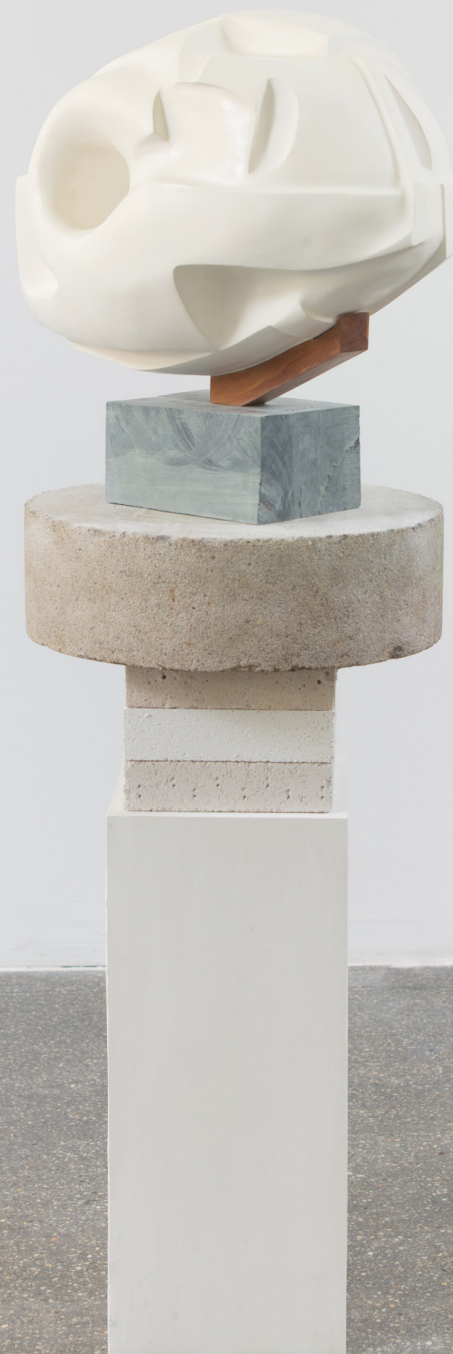
Christina Kruse Will o the wisp , 2021 [detail] plaster, wax, wood, metal, concrete, soapstone, Ytong building blocks 52 x 18 x 20 in 132.1 x 45.7 x 50.8 cm Edition 1/2