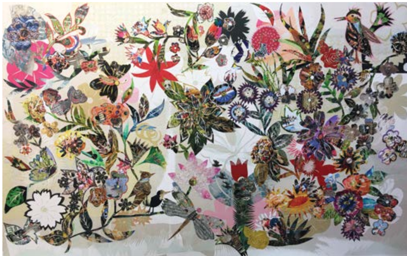
Song Xin, Life in Full Bloom Series 01 , 2016, magazine collage on wood panel 119 x 185 cm.

This is not meant as either a confrontational criticism of the artist's work or of the gallery where it is being shown. It is merely to suggest that the manner in which a narrative achieves its political birthright needs to be carefully considered to the point where art becomes the issue and the message remains part of it without overstating the case. Put another