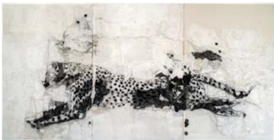
Lin Yan, A Long Ride , 2013–2016, ink, charcoal, and paper collage on linen, 213 x 427 cm.

T he positive positioning of these cut paper flowers, haunted by a paper fence of shadowy black shapes added another layer to Song Xin's discourse. We are told that she is politically concerned with the current refuge problems confronting Central Europe and other nation states in the Middle East, and even Western