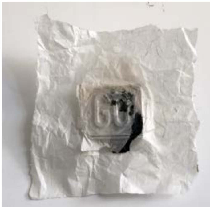
Lin Yan, Go , 2014, ink, xuan paper and wax, 33 x 35 cm.

The tension one senses between Lin Yan's forms—whether realist or abstract, or more correctly, metaphysical (in the Taoist sense)—is inexorable. Her works are identified as having the kind of energy ( qi ) that brings new life into a static space, forms that transfigure the way things appear when they don't really become evident to our senses, when they relinquish their ability to stand out and assume a delicate, strident velocity, an often fierce momentum as they do in the sculptural forms and painting's imagery, often combined as one, as seen in GO (2015) by Lin Yan. Here a simple, yet powerful English word dominates the centrality of a crumpled quadrilateral space, touched