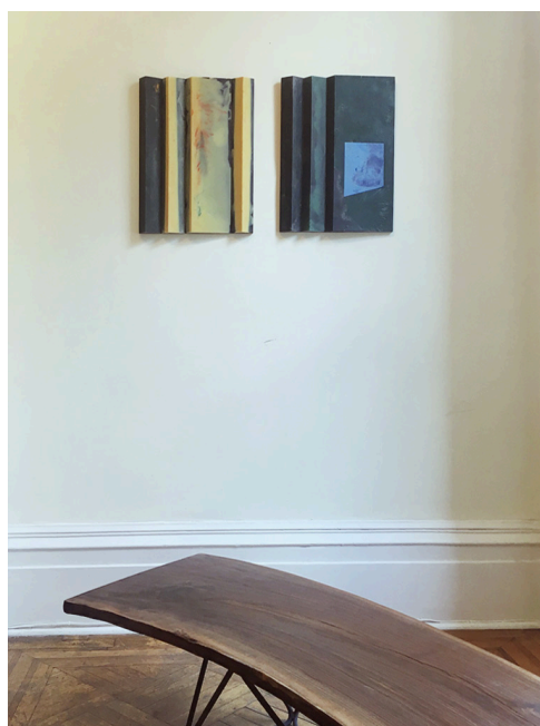
NOVOSTROI #8 , and NOVOSTROI #10 , both by Anton Ginzburg, 2013; Octahedron' bench / coffee table , (edition 7), by Christian Wassmann, 2015