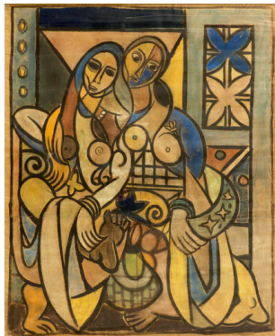
A watercolor and gouache circa 1937 by the Cuban-born artist Wifredo Lam.

It helps that Salon is just hitting its stride, in its second year under this name, its third altogether. With 53 participants instead of the 60 or 65 usual to the armory, it is spacious and logistically relaxed. The large majority of outstanding European dealers (31), many of them from Paris, may guarantee freshness for several years to come.