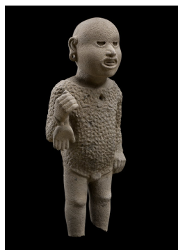
A macabre Aztec figure of a man wearing the flayed skin of a human-sacrifice victim.

But the Modern-design-dominant impression doesn't hold. At Galerie Gmurzynska, modern, mostly European depictions of the nude hold sway. A large painting circa 1937 of two women — a Picassoid exercise in black lines and stained-glass color — by Wifredo Lam is unusually strong. It is followed by all kinds of unexpected items, including an astounding relief by Mikhail Larionov from around 1912 and a gaudy fusion of Jean-Michel Basquiat and Richard Prince pulled off by none other than the actor Sylvester Stallone, who is a better, or at least more energetic, painter than Bob Dylan.